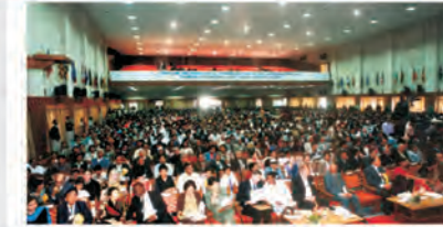
VENUE — World Unity Convention Center CMS, LDA Campus Kanpur Road, Lucknow, UP www.cmseducation.org/events_conf/principals.htm DATE — 19-21 December, 2013