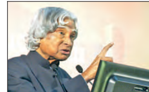
MAKING A POINT

Earlier, the second day of Literature carnival, organised by Lucknow Expressions in association with The Times of India and Navbharat Times, started with a panel discussion, 'Hansa Jaaye Ake-la': A Tribute to Rajendra Ya-