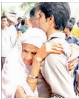
Pilgrims being given a warm send off by relatives at Haj House on Monday

Officials of Haj Committee said 616 pilgrims -- 326 men and 290 women -- boarded the two flights that departed from Amausi airport at 8.20pm and 11.10pm. While the first flight carried 350 pilgrims, the other flight had 266 pilgrims.