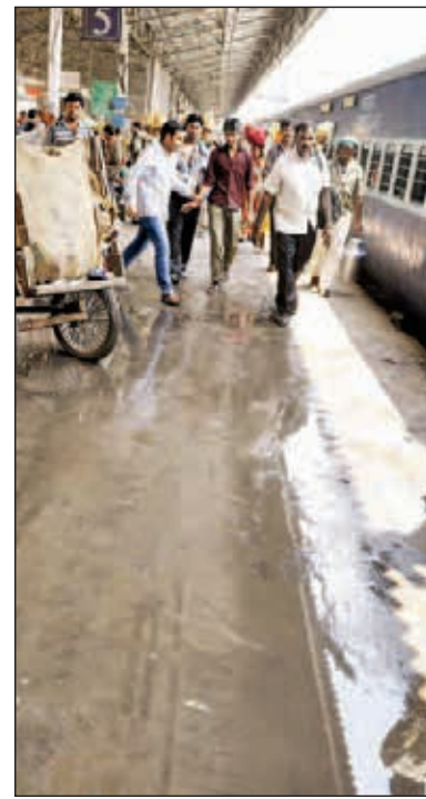
FACELIFT NEEDED: Railway station has several areas that need attention

To enhance the experience of visiting the station with a 90-year-old history, service must also be provided with a smile. This should be made integral to the functioning of the railways. Introducing a corporate culture may improve service to the passengers. This