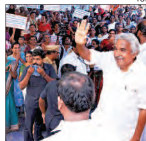
CM Oommen Chandy during an election campaign at Kizhakkambalam on Tuesday evening

He blamed the Left parties for creating several hurdles to