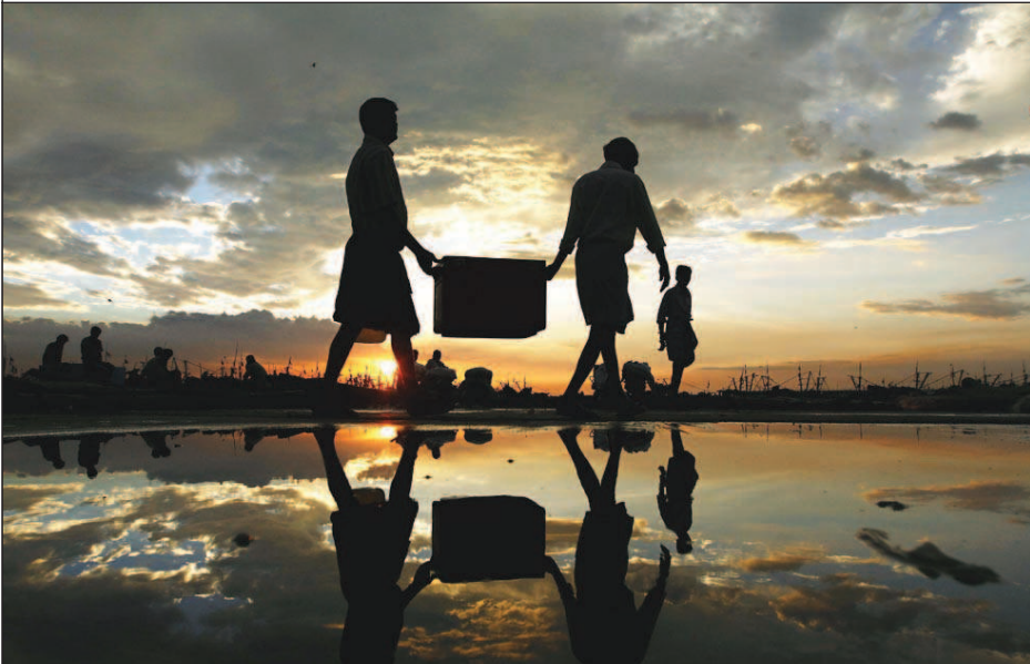
FIRST COME, FIRST CAUGHT: Fishermen return to shore with the day's catch at Kasimedu fishing harbour on Friday morning